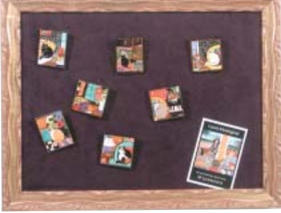
New Bella Moulding – It's Fun!!!