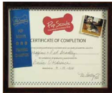
Basic Obedience Class Certificate & Blue Ribbon