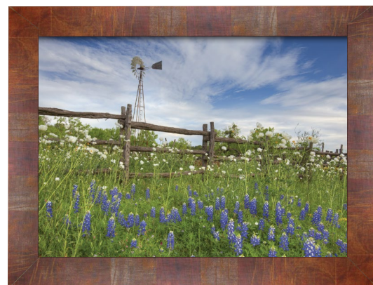
Windmill over Bluebonnets and Poppies