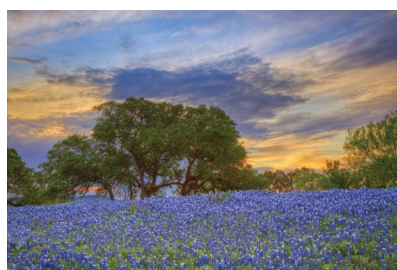
Bluebonnets Under an Evening Sky