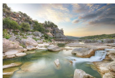
Pedernales Falls Morning in August