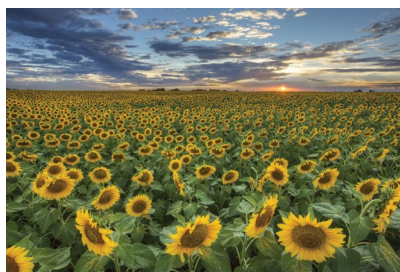
Texas Sunflower Sunset