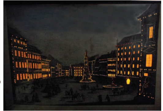
Illuminated print with cordless LED picture light

Bradley's unconditionally guarantees our quality and your satisfaction